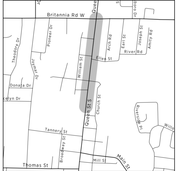
Bicycle lane study area