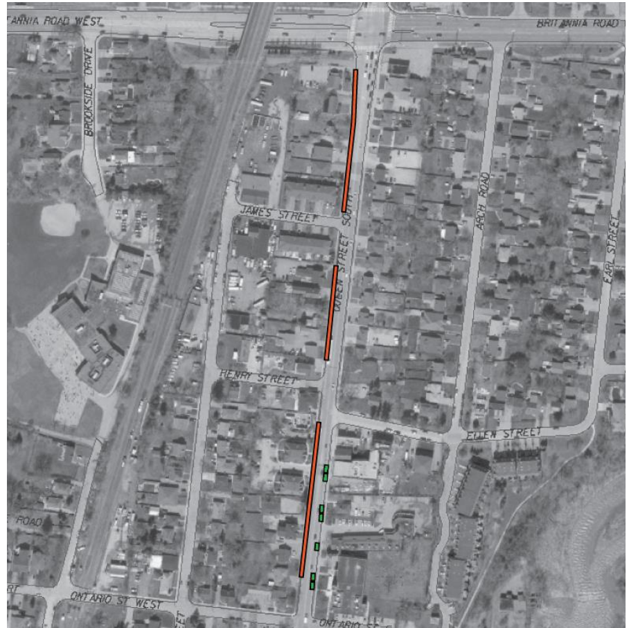
Locations along Queen Street in the study area where parking is currently permitted. Parking on the west side (red) would be prohibited.